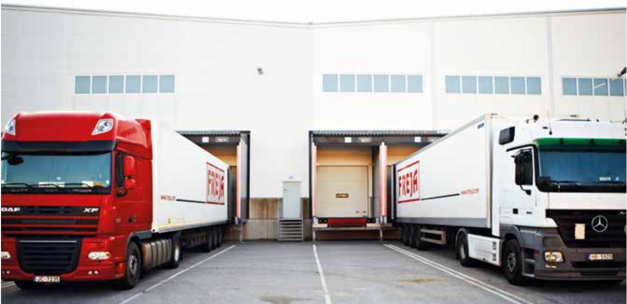
Jordbromalm 4:33, Haninge.

In order to prevent and detect errors and deviations, there are, for example, systems for attestation rights, reconciliations, approval and reporting of business transactions, reporting templates as well as accounting and valuation policies. These systems are continuously updated. Internal information and external communication are regulated at the overall level by means of the information policy. Internal information is disseminated through regular information meetings.